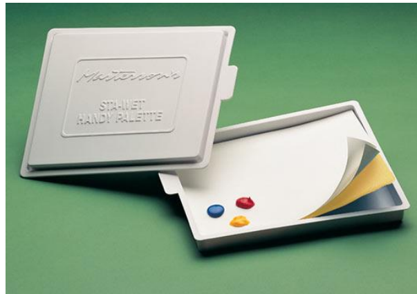
Stay wet palette recommended

*Supplies provided for the course include: Paper, canvas, stretcher frames, primer, gels and acrylic mediums