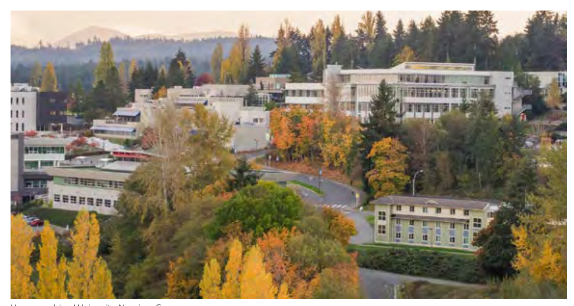
Vancouver Island University, Nanaimo Campus

See the response from the auditee on page 18.