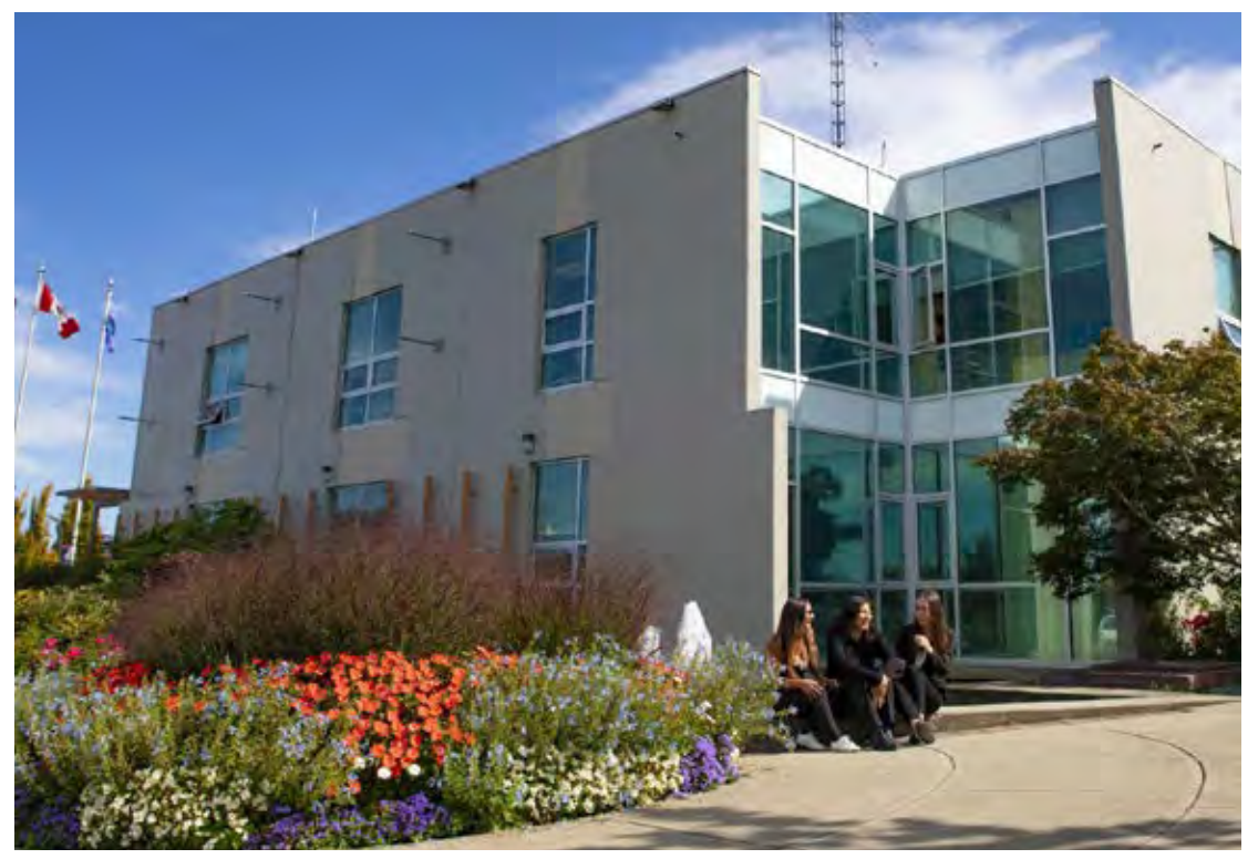
Vancouver Island University, Parksville Qualicum Centre